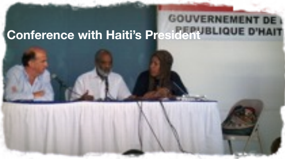
Conference with Haiti's President

The journey was hard work because of the extreme terrain and we had to walk for sections over the dust path to get to the village which was nestled beside the lake.