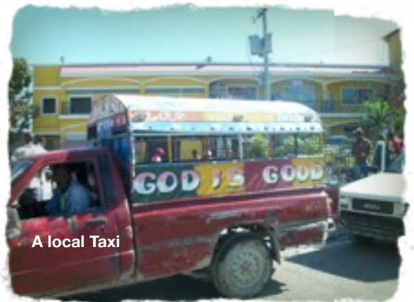
A local Taxi