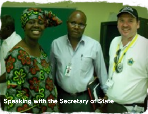
Speaking with the Secretary of State

Immediately on our arrival a crowd of 400 people gathered to see what we had brought. The group had managed to bag some rice for ease of distribution but it would have been easy to allow things to descend into chaos. Thankfully we had been joined by a group of guys from New York who have been travelling to Haiti for the last two years to help homeless children. They were a tough looking group dressed in a military style which helped us manage the crowd who were desperate for any help we could give which included the basic medical aid we have been administering.