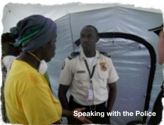
Speaking with the Police

It was a moving experience to see how many people were thankful and they broke into song as they waited in line. Of course as you can imagine the need was greater than the supply so we have promised to return and bring more supplies when we have them.