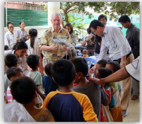
Gift distribution to the orphanage children at the new Elim Church Centre