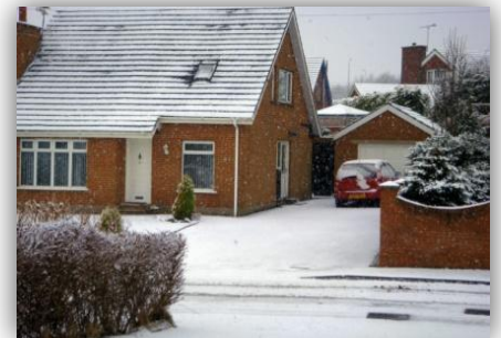
All our Khmei young people would love to experience snow. We agree with them that it is picturesque and very beautiful but they have no concept of 'cold' - they know cool - but not freezing cold.