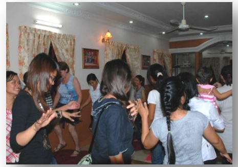
Our Fellowship Nights continues at our home on the third Tuesday in the month.