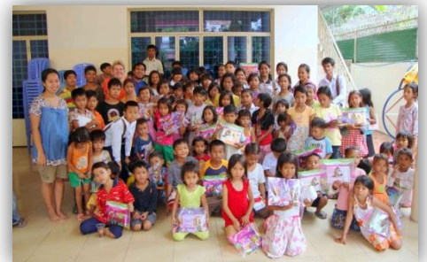
For example, a local orphanage asked could they hold a barbecue in the yard and huge porch area. Around 80 were there. Sadly most of the children are HIV+.