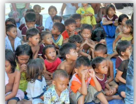
Some of our Steung Meanchey dump village children praying during a recent Saturday morning visit.