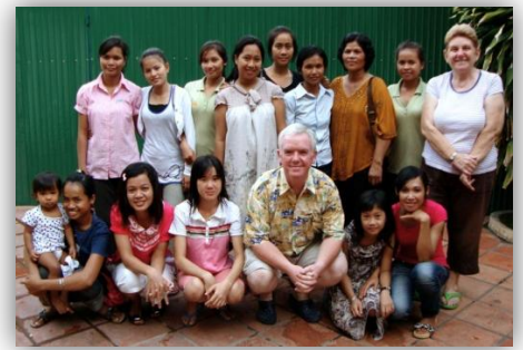
Our Day Care and Church Centre staff on the day we moved into the new centre.