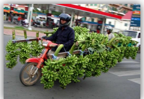
You think you have seen everything in Cambodia, and then something like this comes along. So the question is how many bananas can you get on one motorbike?