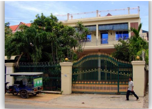
The new Church Centre premises on St 430. It's bigger and with huge potential for God's work. Our policy is that it is God's facility - so where we can we will share, allowing smaller Christian organisations to book and use the Church facilities.