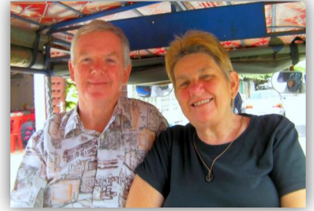
Back for another spell, serving God in Cambodia.

While we were back in Northern Ireland, our home church provided a taxed and insured car for us. A welcome, Godly gesture! We got around a lot. Apart from my daily run to school we drove to over thirty venues around Ulster where we had been invited to speak about God's work in Cambodia.