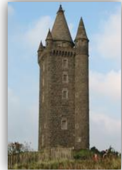
Scrabo Tower is the landmark of our home town of Newtownards, Co Down. It's often cloaked in rain clouds. Cambodia is hot all of the time and every now and again we miss the cold, damp climate of N. Ireland.