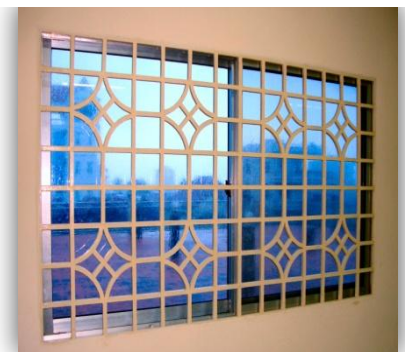
All windows in Phnom Penh are secured with fixed steel lattice, often in attractive designs. This is fixed in the wall during the buildings construction. Sliding glass to turn the rain and a mosquito netting screen, completes the window configuration.