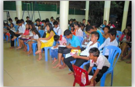
The English classes have re-started in the new place and have taken off. This is only our fifth night and already the outdoor classes have mushroomed to over sixty.

Our Fellowship Nights continues at our home every third Tuesday in the month. Staff from the Day Care Centre and Khmer church, meet for a time of study, praise and worship, followed by snacks and fellowship. We thank God as we see these young Christians hunger for the word of God. Please keep them in your prayers.